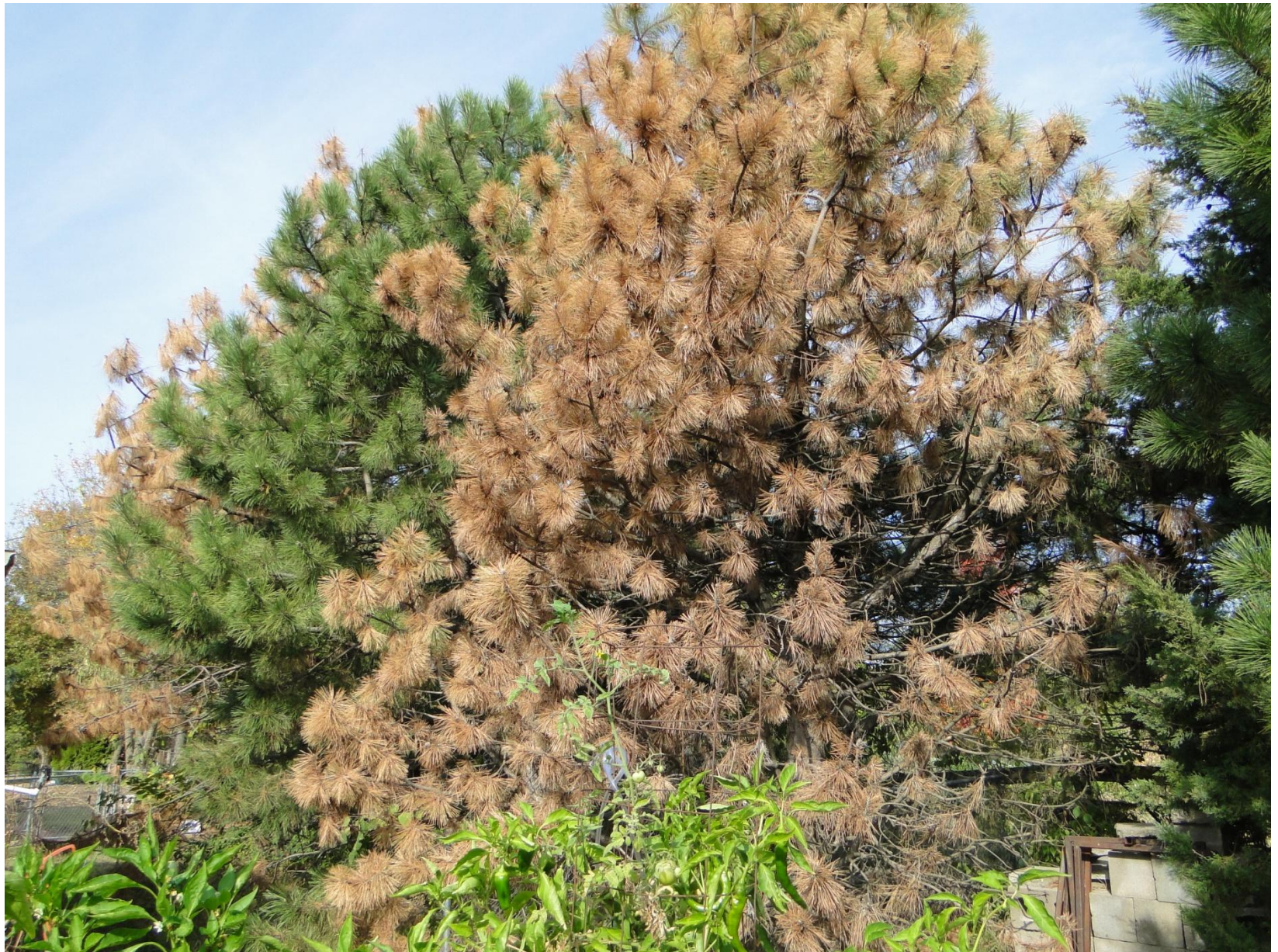
Pine Wilt Disease, 30Oct2010